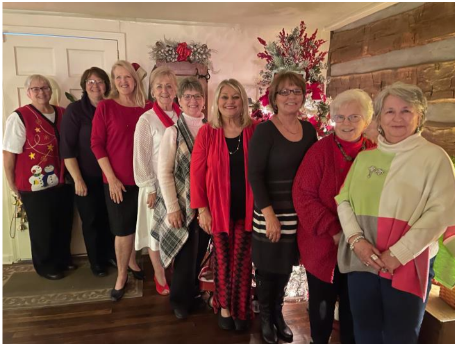
Members of the GFWC Morgan County Woman's Club celebrated a successful club year with a delightful 3-course Christmas tea at Emily's Welcome Inn in Campton, KY!