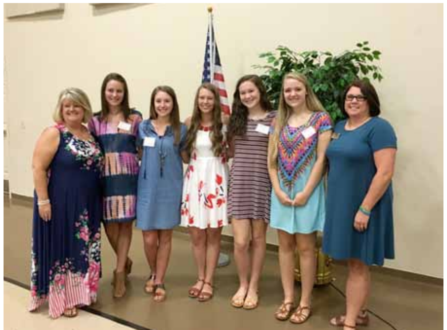
GFWC Kentucky Benton Junioresettes