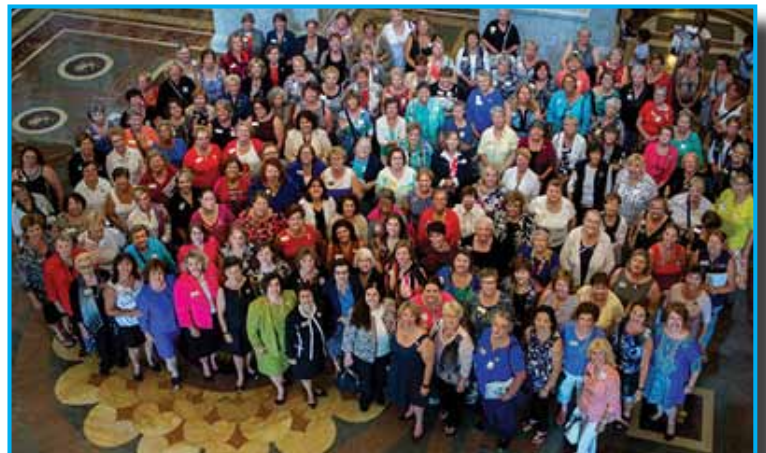
GFWC Board of Directors